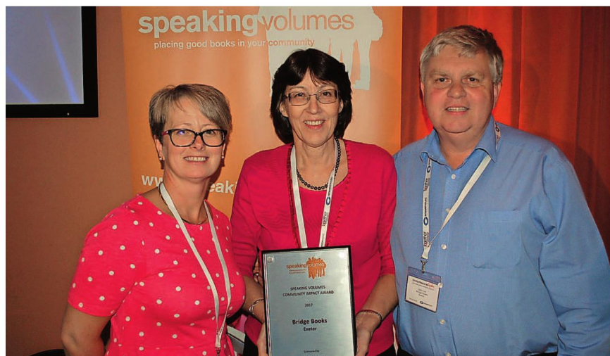
Bridge Books in Exeter is celebrating 10 years

Bridge Books is situated at the Exe Bridges roundabout by the river on Okehampton Street and opens from Monday to Saturday 9:30am – 5:00pm. ■ bridgebookshop.co.uk