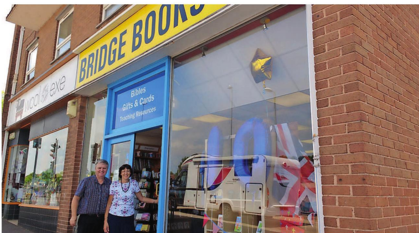
Bridge Books in Exeter is celebrating 10 years

This has included 'pop-up' bookstalls at events like the Devon County Show and